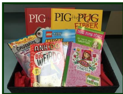
Book Week raffle prize pack